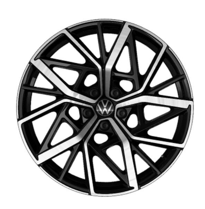
20" "Cannes", Black, diamond-turned