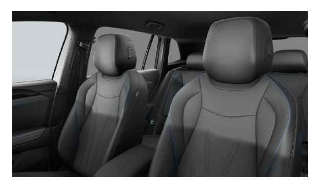
Soul Black - Varenna Leather (Package WL1) Soul Black (ZN) Optional - / R-Line & R-Line 75