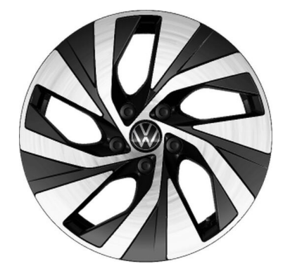
"Venezia" 17, Black, Diamond Turned

The addition of optional extras may result in the vehicle increasing in Co2 g/km and therefore, attracting a higher rate of VRT than described in this product guide. For your exact configuration value, both Co2 g/km and RRP, please visit volkswagen.ie configurator.