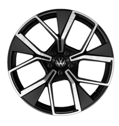
Black / Grey, Diamond Turned, Volskwagen R