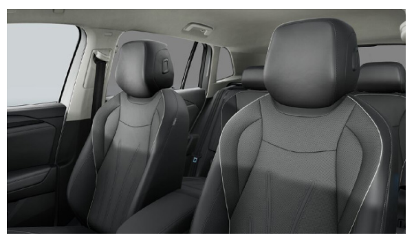
Soul Black - Varenna Leather (Package WL1) Soul Black (AP) Optional - / Launch Ed / Elegance