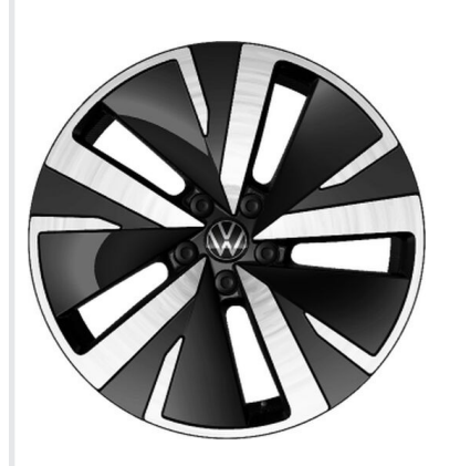
19" "Catania", Black, Diamond Turned