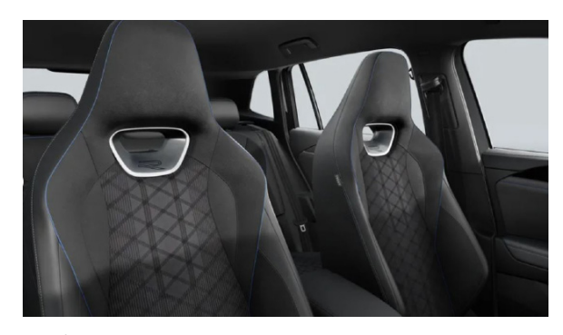
"R-Line" Cloth Soul Black (ZN) Standard – R-Line & R-Line 75