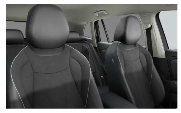
Soul Black Cloth Soul Black / Ceramique (AP) Standard – Elegance