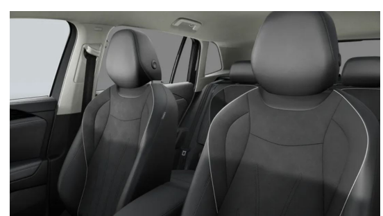
The above specifications are for information purposes only as our products are continually updated and changes may be made to the specifications at any time. If you require any specific feature, you must consult your local dealer who is regularly updated with any change in specification. Specifications are subject to change without notice.