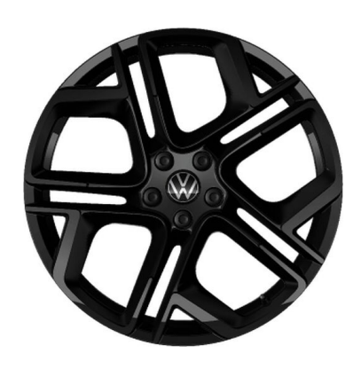
20" "York", Black Volkswagen R

The addition of optional extras may result in the vehicle increasing in Co2 g/km and therefore, attracting a higher rate of VRT than described in this product guide. For your exact configuration value, both Co2 g/km and RRP, please visit volkswagen.ie configurator.