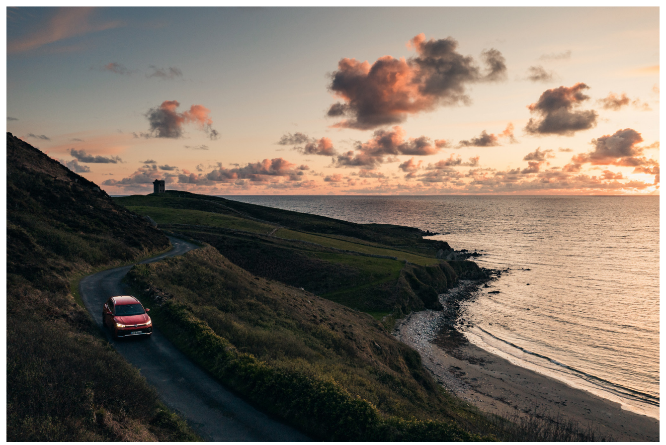
The above specifications are for information purposes only as our products are continually updated and changes may be made to the specifications at any time. If you require any specific feature, you must consult your local dealer who is regularly updated with any change in specification. Specifications are subject to change without notice.