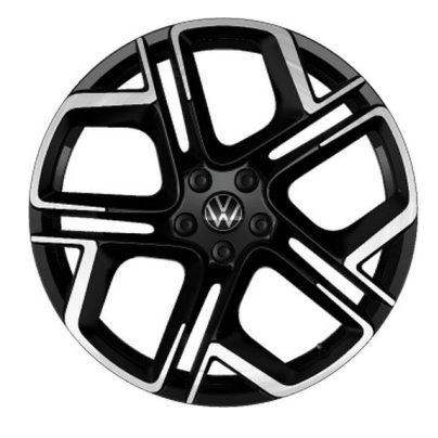
20" "York", Black diamond-turned