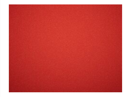
Persimmon Red Metallic*