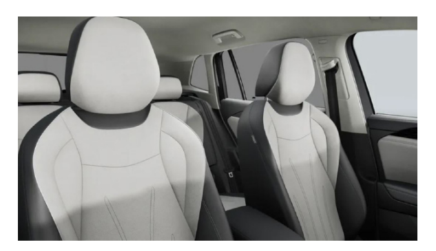
Mistral Grey Cloth Soul Black / Ceramique (AQ) Optional - Elegance