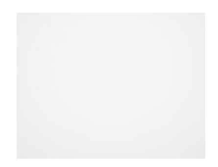
0Q0Q Pure White Solid* Note: Not available in combination with Black Stlyle Exterior Pack