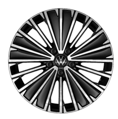
"Napoli" 18, Black Black, Diamond Turned