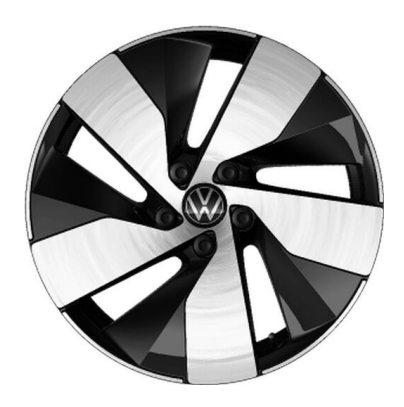
18" "Bologna", Black, Diamond Turned