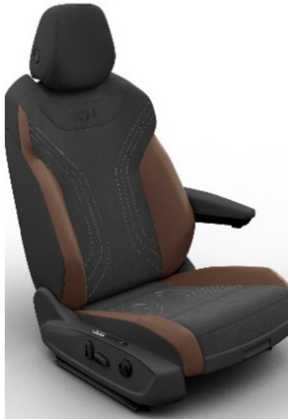
Artvelours Microfleece/Leatherette Soul/Florence Brown Standard from ID.4 PURE / PRO

Electric controls are available via the addition of the Interior Plus Package