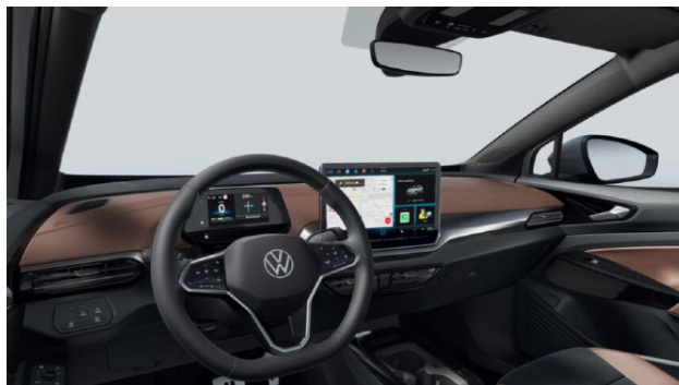
Standard selection from ID.4 PURE / PRO