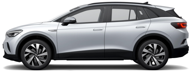
Scale Silver Metallic 1 1T1T