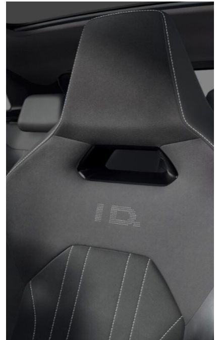
Artvelours Microfleece/Leatherette Soul/Platinum Grey Standard from ID.4 PRO STYLE Optional on ID.4 PURE / PRO

Electric controls are available via the addition of the Interior Plus Package