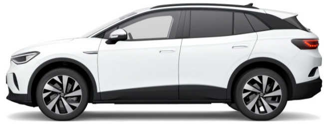
Glacier White Metallic 1 2Y2Y