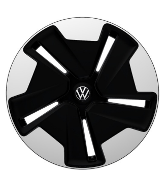
21" 'Bromberg' STANDARD ON ID.Buzz Max. OPTIONAL on ID.BUZZ Life, Family & Tech.