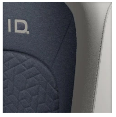
'Seaqual' seat trim X-Blue-Mistral/Soul-Mistral/Black Standard on ID.Buzz Family onward Not available on ID.Buzz Life