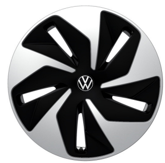
19" 'Venlo' STANDARD ON ID.Buzz Family. OPTIONAL on ID.BUZZ Life.

235/45 R21 104T XL 265/40 R21 108T XL Tyres