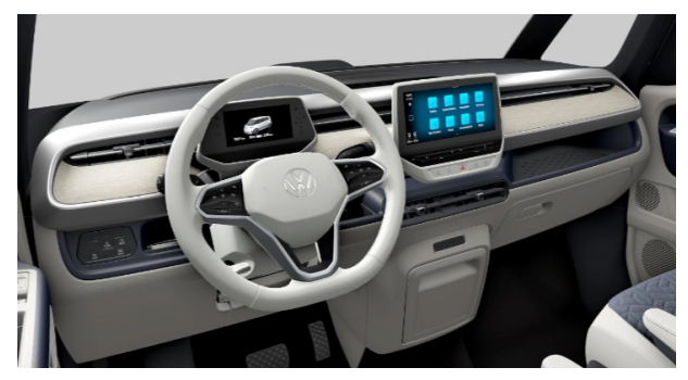
X-Blue-Mistral/Soul-Mistral/Black Standard on ID.Buzz Family onward Not available on ID.Buzz Life