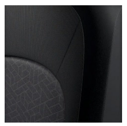
'Fabric' seat trim Palladium-Soul/ Soul-Soul/ Black Standard on ID.Buzz Life Not available on ID.Buzz Family onward