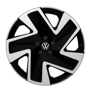
20" 'Solna' STANDARD ON ID.Buzz Tech. OPTIONAL on ID.BUZZ Life & Family.

8J x 20 in front 10J x 20 in rear Black, diamond-turned surface.