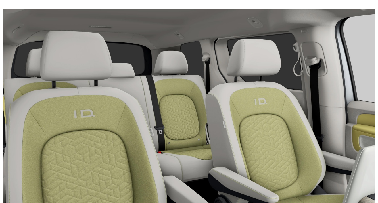
Note: Interior seat trim colours for ID.Buzz Family onward are determined by exterior colour selection. Note: The print processes does not allow exact reproduction of the upholstery & insert colours.