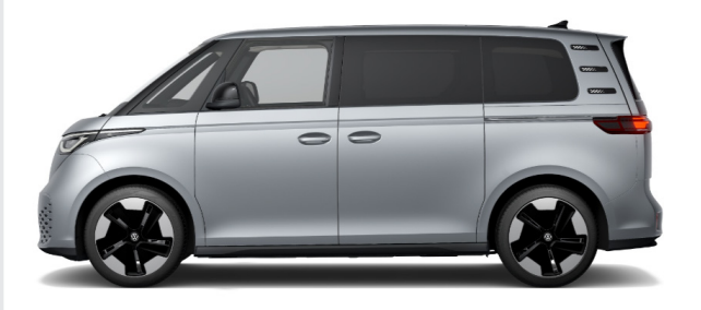
Mono Silver Metallic<sup>1</sup>