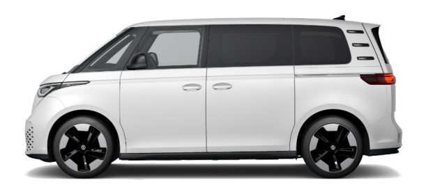
Candy White Solid<sup>1</sup>