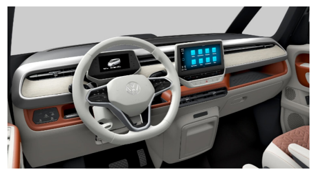
Saffron Orange-Mistral/Soul-Mistral/Black Standard on ID.Buzz Family onward Not available on ID.Buzz Life