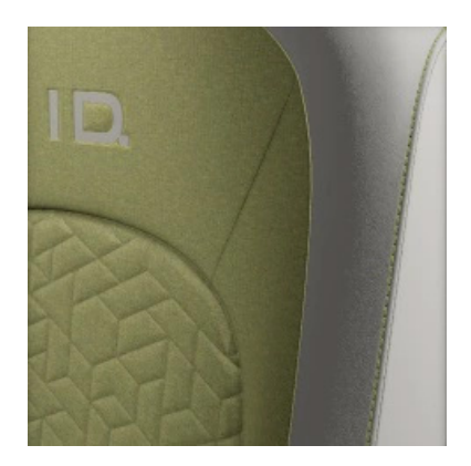
'Seaqual' seat trim Lemon-Mistral/Soul-Mistral/Black Standard on ID.Buzz Family onward Not available on ID.Buzz Life