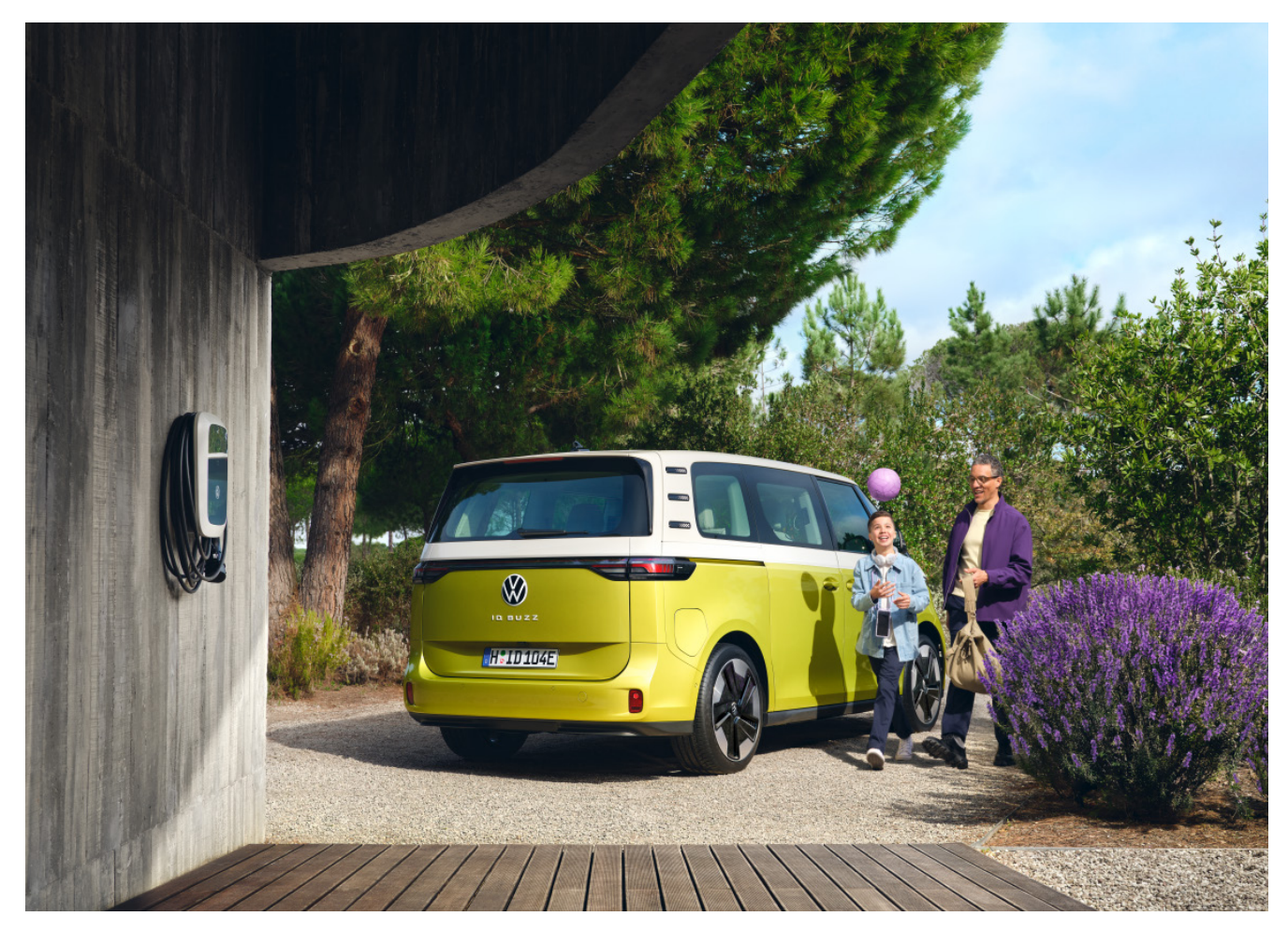
■ Standard - Not available