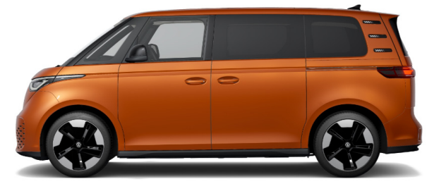
Energetic Orange Metallic<sup>1</sup>