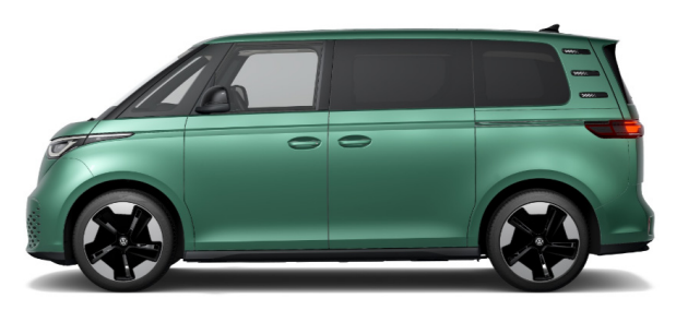
Bay Leaf Green Metallic<sup>1</sup>