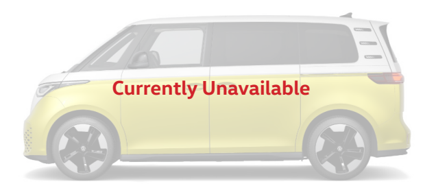
Candy White/ Pomelo Yellow Metallic<sup>1</sup>