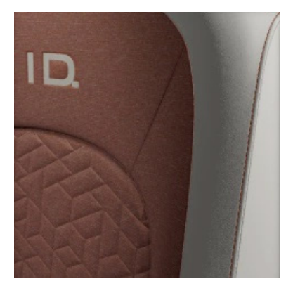
'Seaqual' seat trim Saffron Orange-Mistral/Soul-Mistral/ Black Standard on ID.Buzz Family onward Not available on ID.Buzz Life