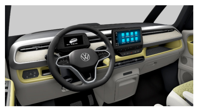
Black Steering Wheel & Infotainment Surround Optional on ID.Buzz Family onward Standard on ID.Buzz Life

Note: Interior trim colours for ID.Buzz Family onward are determined by exterior colour selection Note: The print processes does not allow exact reproduction of the upholstery & insert colours.