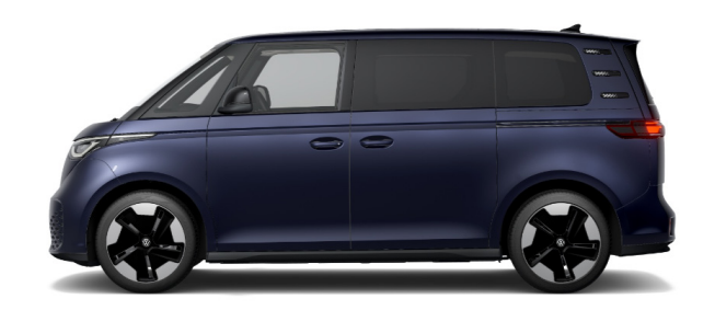
Starlight Blue Metallic<sup>1</sup>