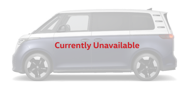
Candy White/ Starlight Blue Metallic<sup>1</sup>