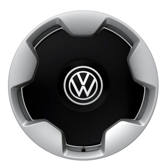
20" 'Stockton' OPTIONAL on ID.BUZZ Life, Family & Tech.

8J x 20 in front 10J x 20 in rear Silver, with plastic wheel trim (black).