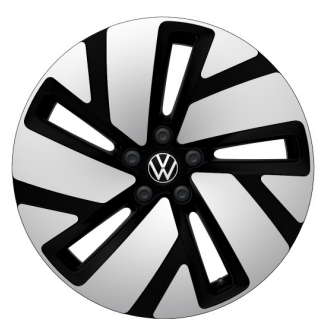
19" 'Tilburg' STANDARD ON ID.Buzz Life. OPTIONAL on ID.BUZZ Family.