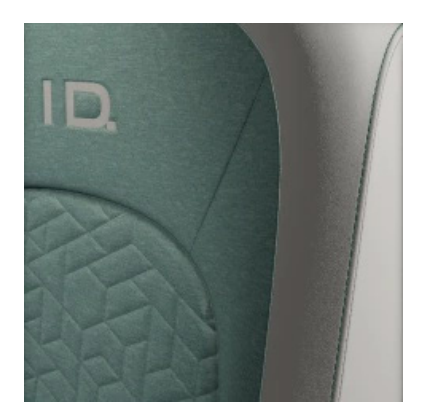
'Seaqual' seat trim Jade-Mistral/Soul-Mistral/Black Standard on ID.Buzz Family onward Not available on ID.Buzz Life