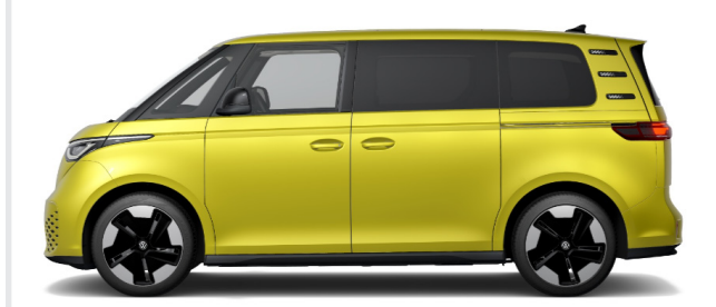
Pomelo Yellow Metallic<sup>1</sup>