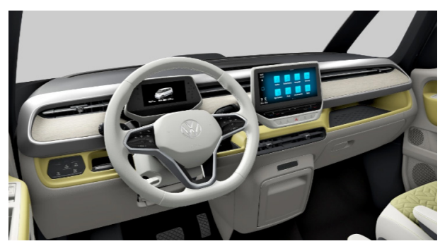
Lemon-Mistral/Soul-Mistral/Black Standard on ID.Buzz Family onward Not available on ID.Buzz Life