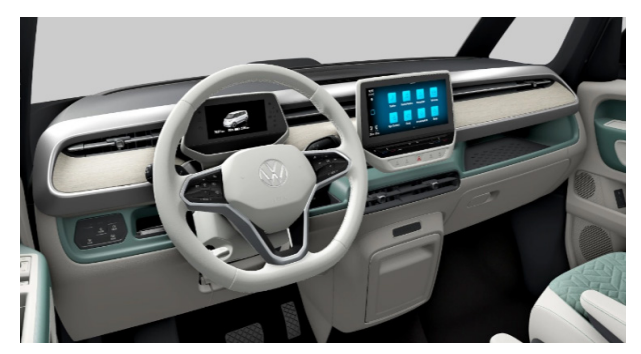
Jade-Mistral/Soul-Mistral/Black Standard on ID.Buzz Family onward Not available on ID.Buzz Life