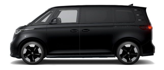
Deep Black Pearl Effect1