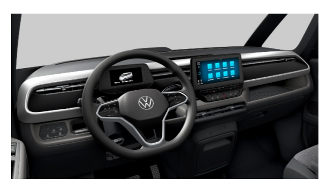
Palladium-Soul/ Soul-Soul/ Black Standard on ID.Buzz Life Not available on ID.Buzz Family onward