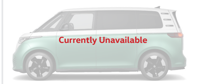
Candy White/ Bay Leaf Green Metallic¹