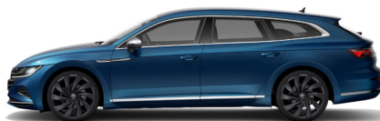
Kingfisher Blue Metallic* 1