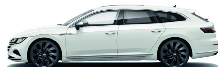
Oryx White Pearl Effect** 1