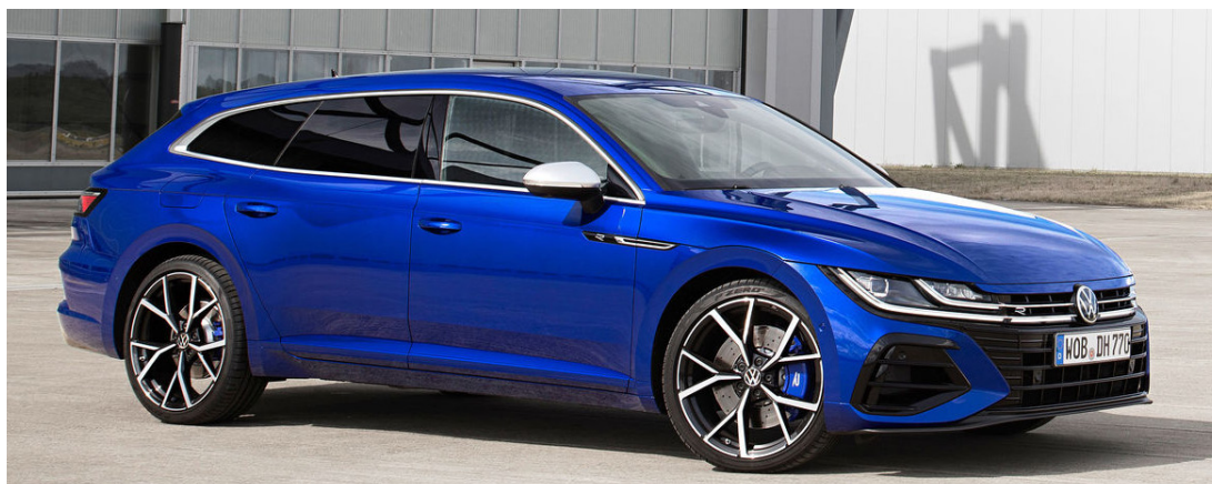
The above image shows optional Lapiz Blue metallic paint with optional 20" Estoril alloy wheels

The above specifications are for information purposes only as our products are continually updated and changes may be made to the specifications at any time. If you require any specific feature, you must consult your local dealer who is regularly updated with any change in specification. Specifications are subject to change without notice. Effective from 25 May 2021, for production from CW48/2020 onwards. All prices include VAT and VRT. These prices are subject to change once technical data comes available.