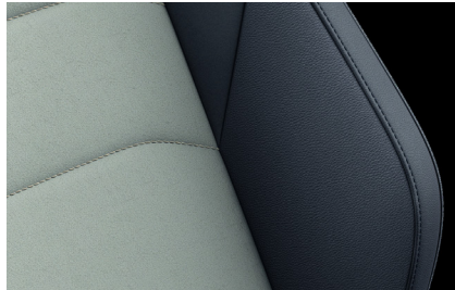
"ArtVelours Microfleece/Vienna" cloth & leather Mistral/Raven (YS) Optional on Elegance models