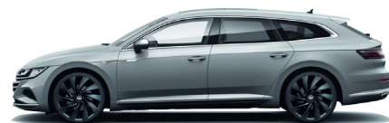
Pyrite Silver Metallic*