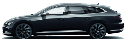
Urano Grey Solid