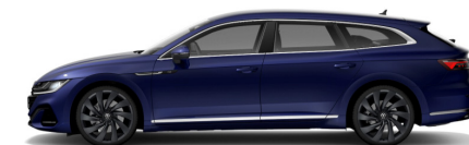
Lapiz Blue Metallic* 1