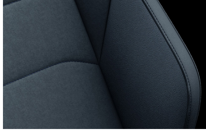
"ArtVelours Microfleece/Vienna" cloth & leather Titan Black (TO) Standard on Elegance