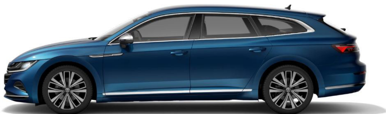
The above image shows optional Kingsfisher Blue metallic paint