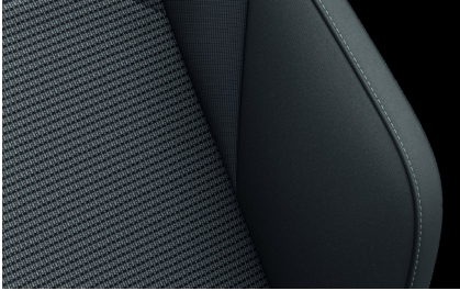
"Sideways" cloth Titan Black (TO) Standard on Arteon Shooting Brake models