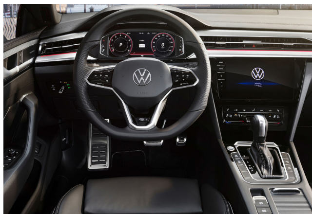
The above images show optional "Nappa" leather pack R-Line, with optional ErgoComfort seats