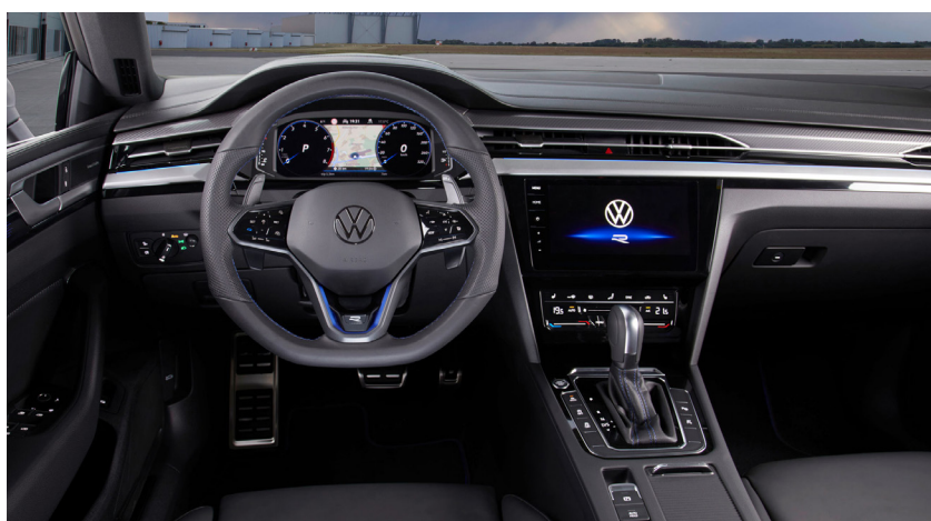
The above image shows optional Navigation System Discover Pro 9.2" display