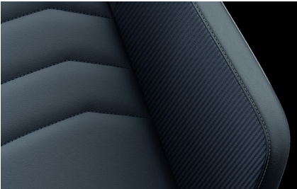
"R-Model Nappa/Carbon" leather* Titan Black (OH) Standard on R Model