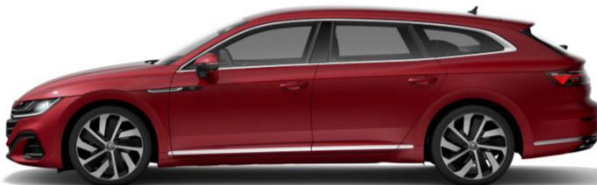
The above image shows optional Kings Red metallic paint

The above specifications are for information purposes only as our products are continually updated and changes may be made to the specifications at any time. If you require any specific feature, you must consult your local dealer who is regularly updated with any change in specification. Specifications are subject to change without notice.