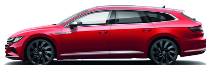
Kings Red Metallic* 1